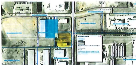
Map and Legal Description (Exhibit A)