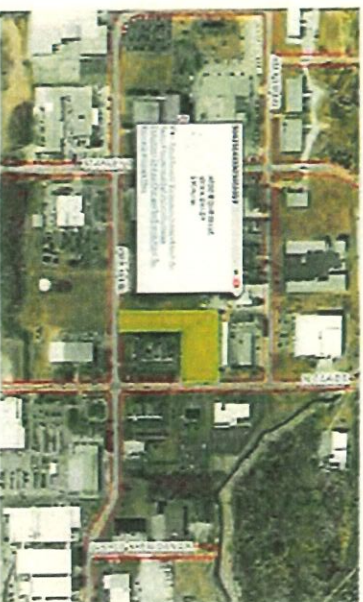
Exhibit A – Map and Legal Description of the Proposed Site

Lot B in the Teachers Credit Union Oak Drive Replat recorded as Instrument No. 202202017 on April 8, 2022 in the Office of the Recorder of Marshall County, Indiana, being a Replat of Lots 3 and 4 and the East Half (E 1/2) of a proposed road in Plymouth Industrial Development Subdivision, part of the Southeast Quarter (SE 1/4) of Section 31, Township 34 North, Range 2 East, City of Plymouth, Center Township, Marshall County, Indiana